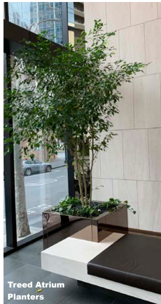
Treed Atrium Planters